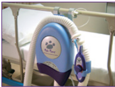
Bedrail Mount 90079