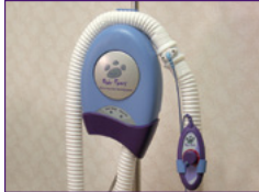
IV Pole Mount 90076