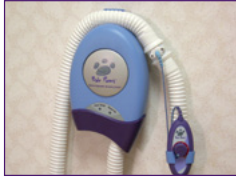
Wall Mount 90080