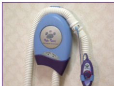
Wall-to-Rail Mount 90074